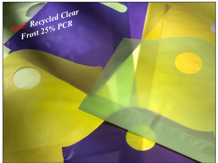
Super Frost Wave & Merchandise Bags