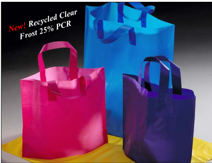
Ameritotes - Opaque Hi-Density Shoppers