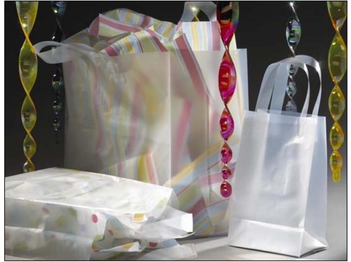
Natural Frost Shopping Bags