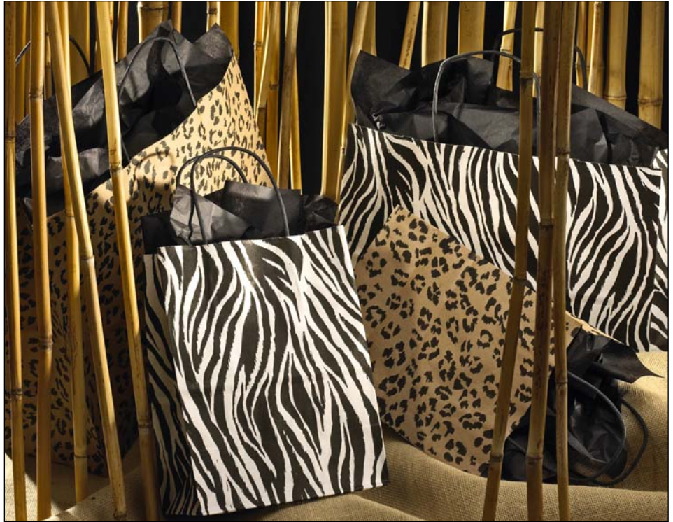
Safari Series: Zebra & Leopard