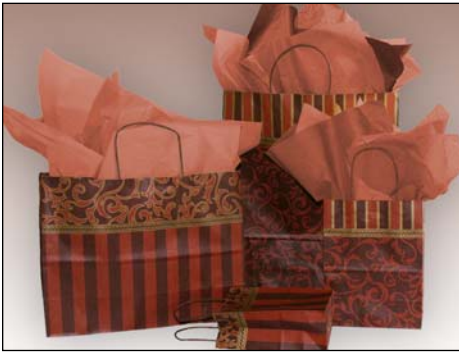
New! Classical Swirls & Stripes - Brown