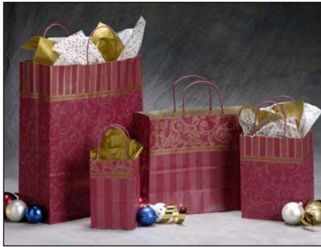
Classical Swirls & Stripes - Burgundy