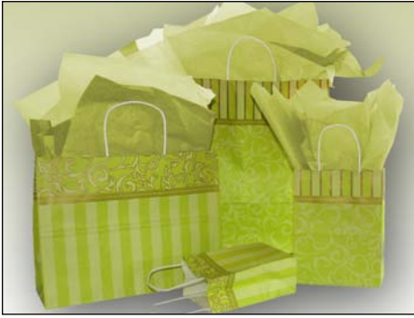
New! Classical Swirls & Stripes - Citrus Sage